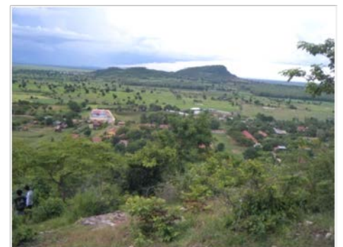
Foyer Lataste, Khla Kaun Thmei

AEC – Lataste / ADTJK is based in Beantey Meanchey, a very underprivileged province in the northwest of Cambodia, next to the Thai border. The local office and the children's protection center are located in Khla Kaun Thmei village, next to Sisophon city. Support is also expanded to Battambang and Phnom Penh for the students who have gone on to university.