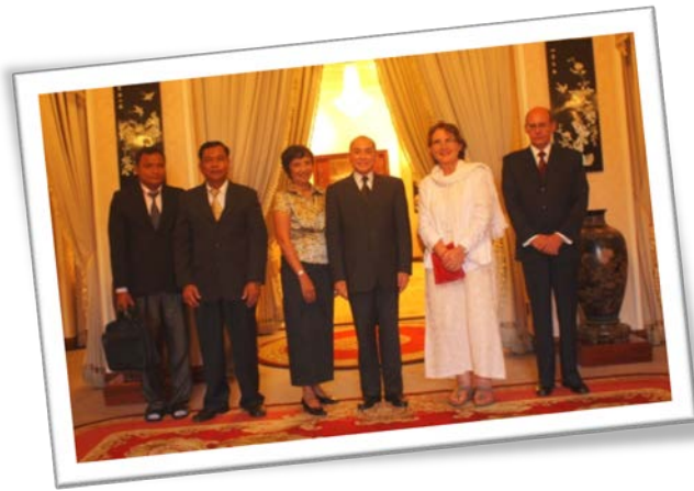
Meeting between the three founders of the organization and the director of Somras Komar school with his Majesty the King Norodom Sihamoni in 2010.

In Cambodia +855 (0)886 203 026 foyerlataste@yahoo.fr